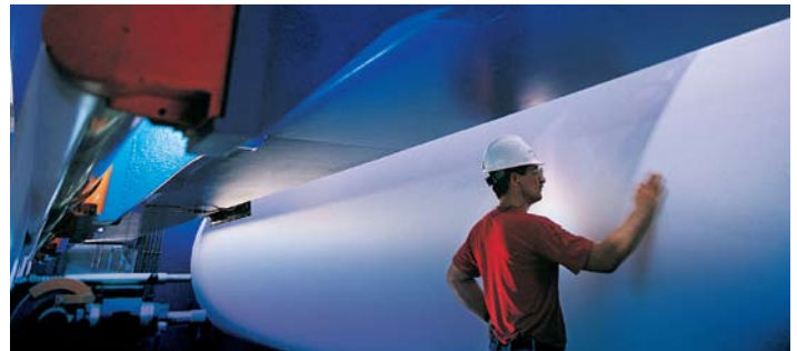
TL Application - Dryer Cylinder

Some paper mills minimize the risk of failure using a slow start-up procedure that builds up heat slowly and transfers it to the inner ring. Mills may also pre-heat the circulating oil used to lubricate the bearings. These methods can prolong bearing life, but require several hours of lost production and revenue. In fact, most mills don't invest the time, and simply take their chances at an inner ring bearing fracture. Some bearing manufacturers have tried to address the fracture problem by developing special steels, often by sacrificing other performance characteristics. One example is bainitic steel, created with a process